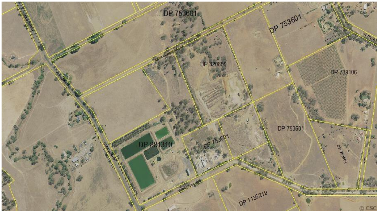
Aerial view of Cootamundra Waste Depot and surrounding properties.