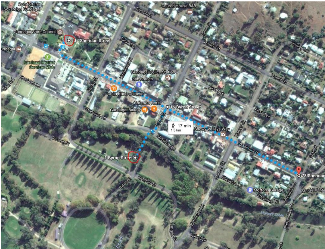
Fig 1.1 Existing toilets located at Carberry Park and Yarri park