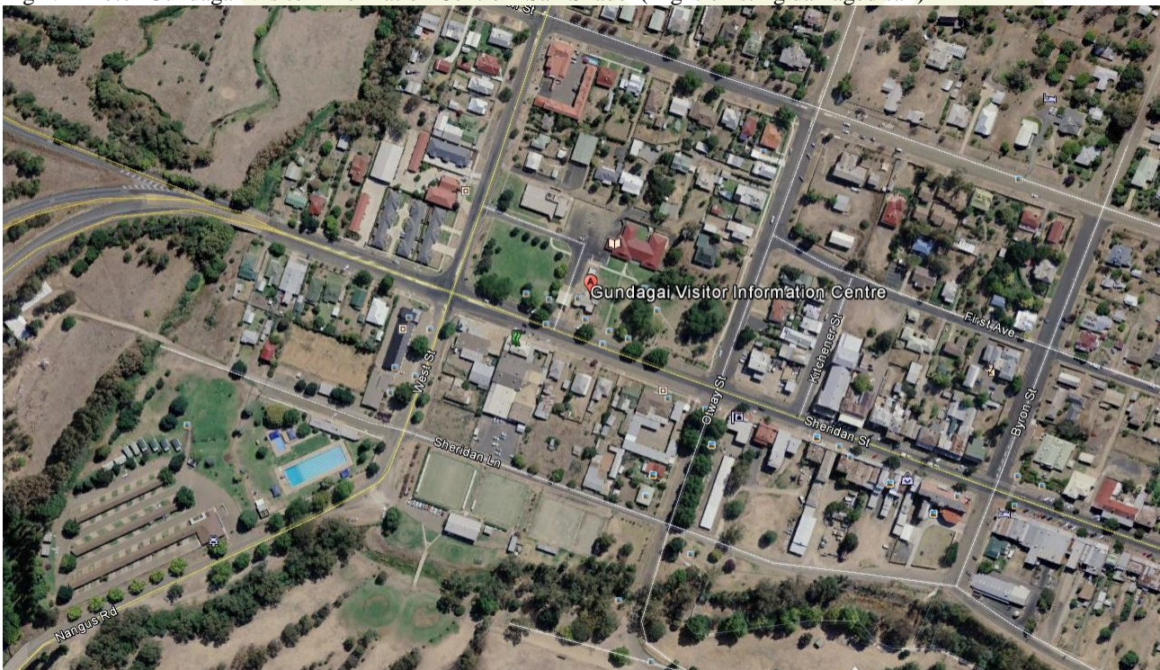
Fig 1.2 Location map of Gundagai Visitor Information Centre