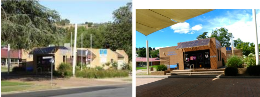
Fig 1.1 Photo- Gundagai Visitor information Centre & Coach Terminal