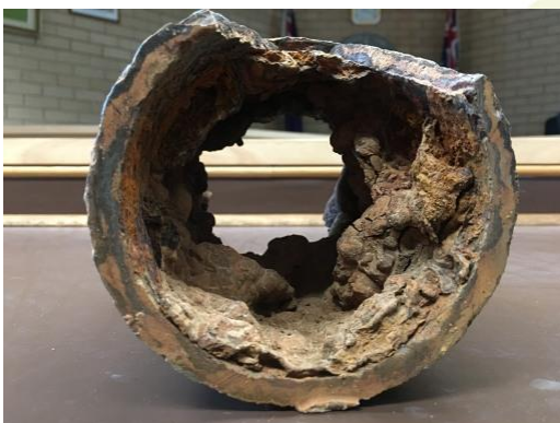
Figure 1.0 Photograph of typical cast iron pipe. Internal section loss is due to mineralisation deposition.